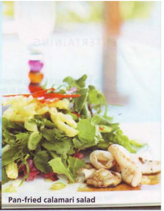
Pan-fried calamari salad