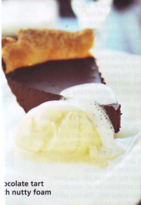
Chocolate tart with nutty foam