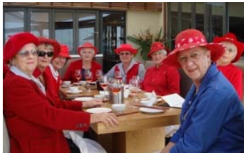
The ladies of The Red Hat Society enjoy the beautiful weather on the terrace during their luncheon at fu.shi