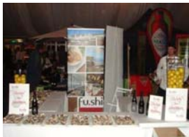
The fu.shi stand at the Knysna Oyster Festival

fu.shi fusion cuisine, BoMa terrace, Chef's bar The Upper Deck lifestyle centre 3 Strand Street, Plettenberg bay Tel: 044 533 6489/6497