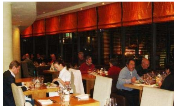
Patrons at fu.shi's recent Iona wine pairing evening

Reservations essential Ph 044 533 6489/6497